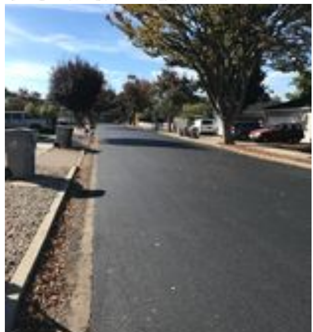
Pictured: Freshly repaved streets in Rosemary Gardens, ready for striping