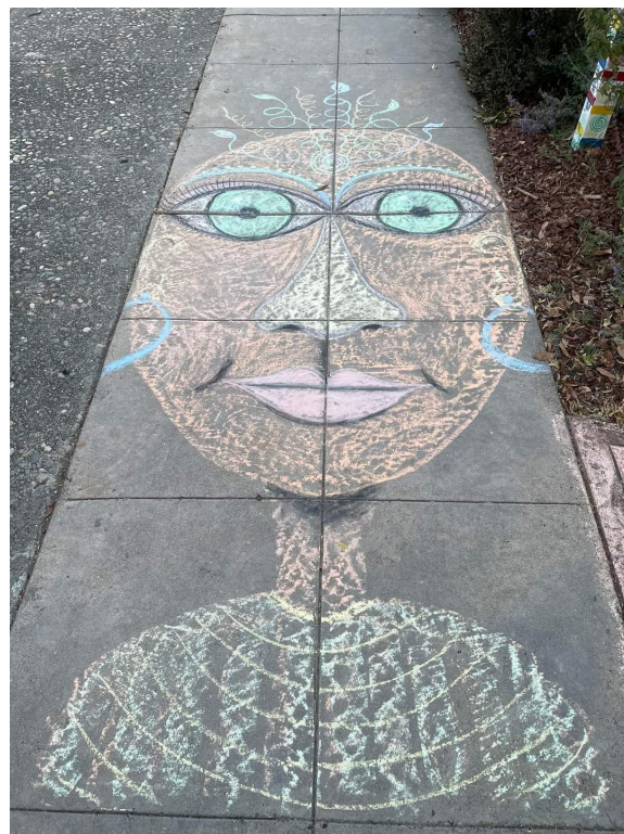
Chalk art by our neighbors during Chalk Art Week.