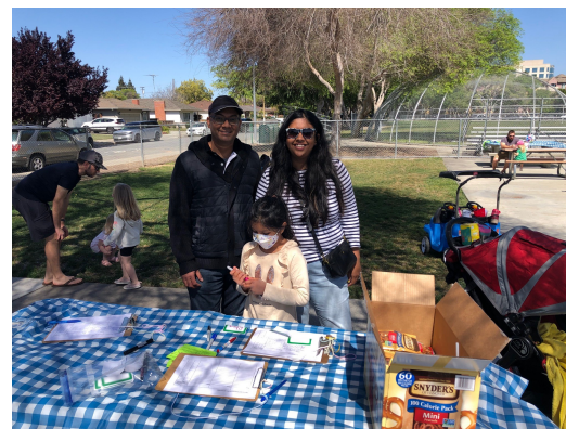
Four activity stations and Easter treats made for a fun day with neighbors.

Sign up for email newsletters at rosemarygardens.org/newsletters