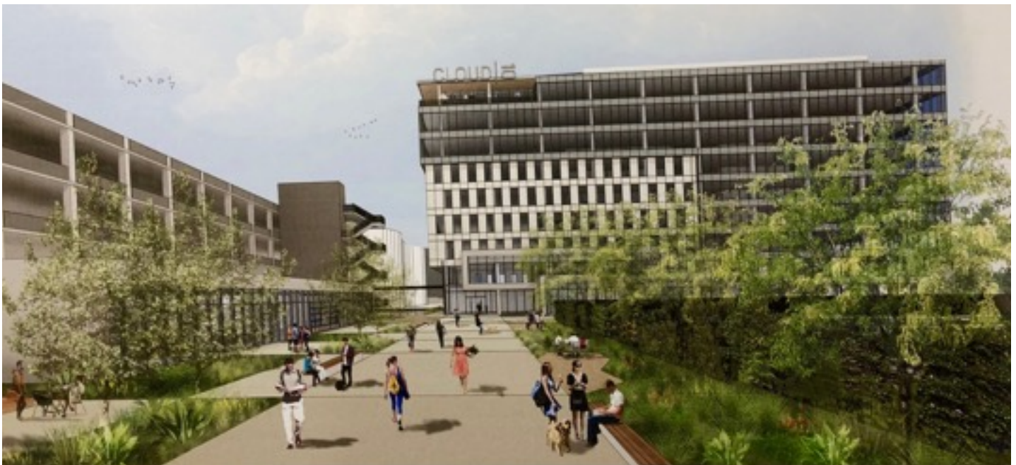
Rendering of new commercial development at 1601 Technology Drive. Fence and landscaping at right indicates border at Rosemary Gardens Park. Additional images can be found on our website: www.rosemarygardens.org

On another note, one board member contacted HPP earlier this summer to request that the planting strip just past RG park extending to the end of Sonora be cleaned up. HPP promptly responded to this request, and as you may have noticed, the area was weeded and mulched and is no longer an eyesore. This experience and the recent outreach makes us hopeful that HPP will continue to strive to be a good neighbor.